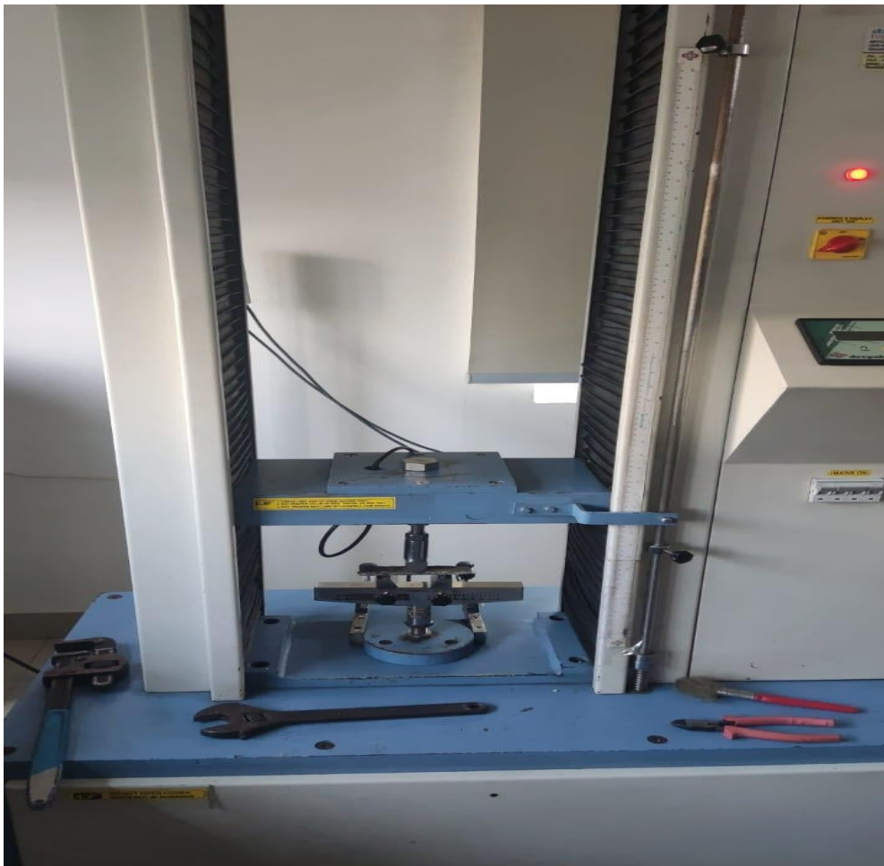
Figure2: 3-Point Bending machine Sample loaded condition for Flexural testing

Where, \sigma is the flexural strength, P is the load, L is the span length, b is the width and h is the thickness of the specimen under test.