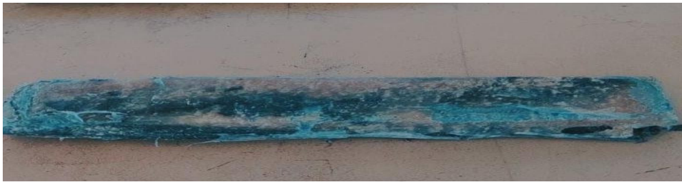
Figure 1: Specimen preparation and Specimen