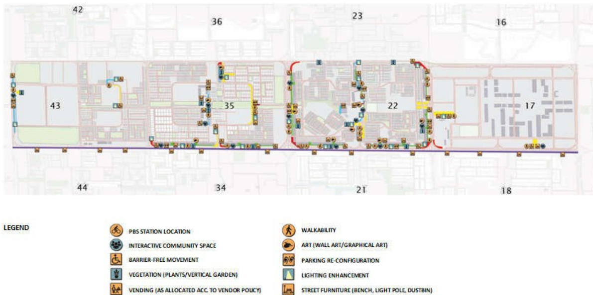
Figure 4. Existing pockets with holistic locations of proposed components throughout the study area

The figure 4 below gives a clear picture of the holistic locations of the components.