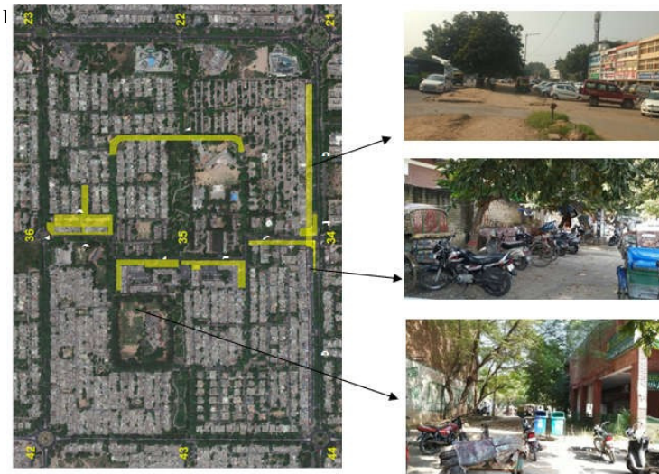
Figure 3. Identified pockets for Placemaking in Sector 35