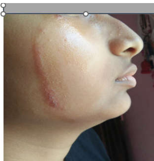
Figure 1: patients' eruption on face before treatment picture on 9th August 2023

diagnosis of herpes zoster of the face as per the Centers for Disease Control and Prevention 2015. [7] Repertorial analysis Repertorization was done by Zomo Homeopathic Software (Mind Technologies, Mumbai, Maharashtra, India), which prioritizes mental generals over physical generals, followed by specific symptoms. [Figure 2]. After the repertorial analysis, Hepar Sulph was found to cover 07 out of 07 rubrics and scored the highest marks, i.e., 12. Silicea scored the same 12 but covered only 4 rubrics, and both Ant Tart and Merc Sol covered the rubrics (04) and scored 11 marks. After consulting Homoeopathic Materia Medica, Hepar Sulph was prescribed. The indications for prescription were a lean, thin patient with weakness and sleepiness, being irritable and angry easily, sweating head on, herpetic eruption on face and cheeks, itching in herpetic eruption, herpetic eruption around orbit, desire for spicy food, thirstlessness, and a chilly thermal reaction. Prescription Two doses of Hepar sulph 200c were prescribed on the day of the first visit, along with a placebo for 1 week. The patient was advised to take rest and increase nutritious foods in her diet. The patient was followed for another 6 months, and no complication or relapse of the symptoms was noted during this period [Table 1].