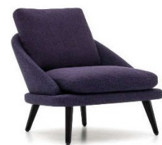
Fig: Lawson Arm Chair